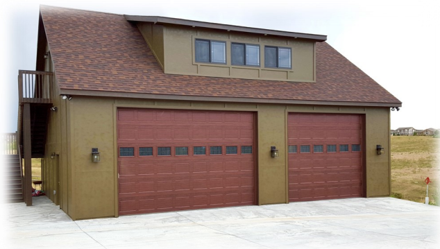
30'x40' Attic Truss w/ Dormer- Outside Entrance