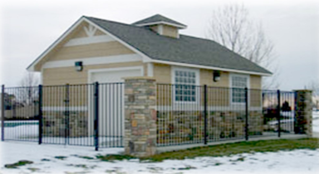
14'x20' Custom Pool-Side Garage