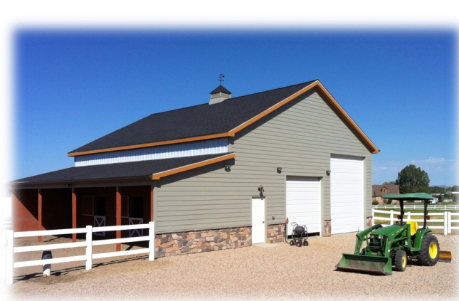
Lap Siding –2- Garage Doors –Lean-To Porch