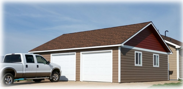
4-Car Garage with Lap Siding and Gable Trim