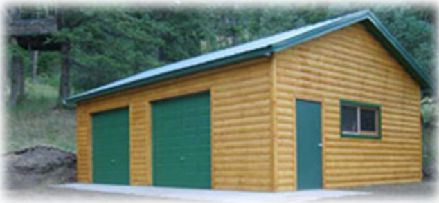
24'x30' Gable Style—Log Siding—Metal Roof