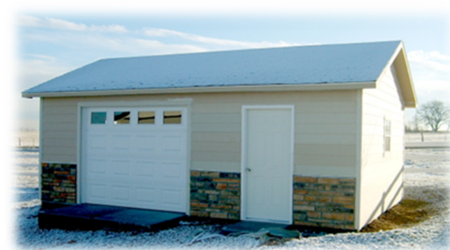
Lap Siding –Shingled Roof– Rock Wainscot