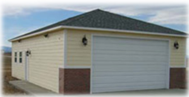
4-Hip Roof –Lap Siding—Brick Wainscot