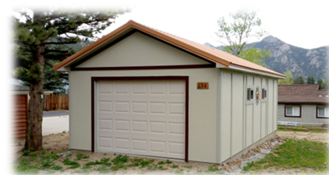
14'x30' Fire-Rated Siding & Metal Roof